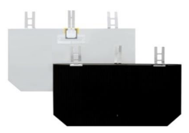
2 Per (26.6 cm<sup>2</sup>)