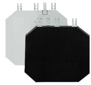
LEONE (59.6 cm<sup>2</sup>)