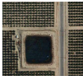
IR LED Test Zone (farm field reservoir)