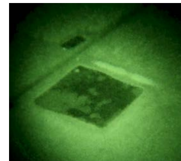
IR LED Test Zone through NVG's (field reservoir illuminated @ 500 ft AGL)