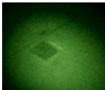
IR LED Test Zone through NVG's (field reservoir illuminated @ 1,500 ft AGL)