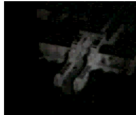
Competing searchlight (800 Watt) in wide focus @ 750 ft.