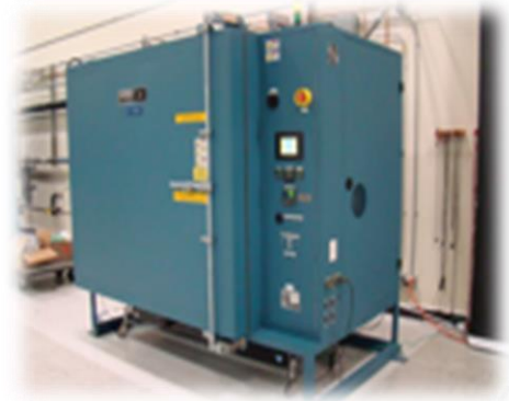
Ultra – Fast Chamber