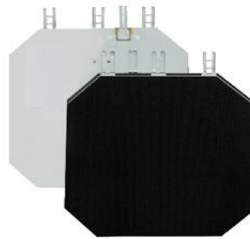
LEONE (59.6 cm 2 )