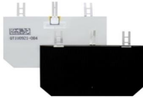
2 Per (26.6 cm 2 )