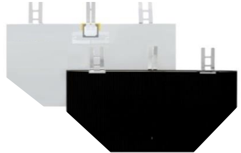
SuperCell (> 72 cm 2 )